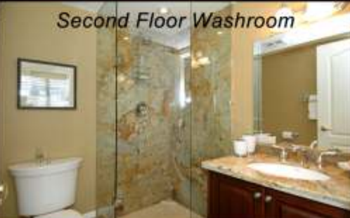
Second Floor Washroom