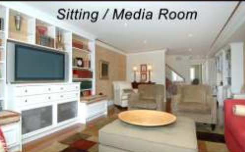
Sitting / Media Room