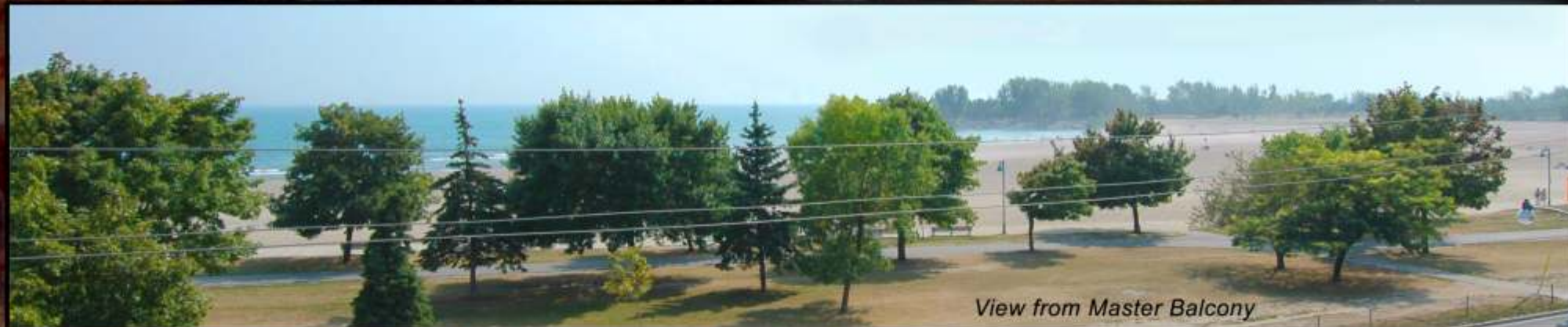
View from Master Balcony