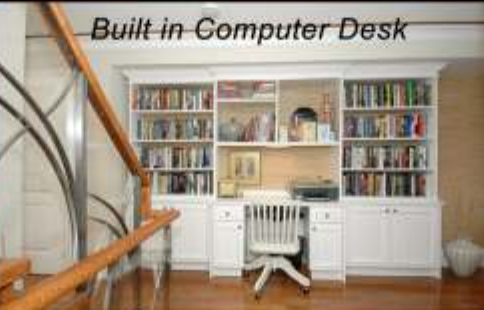
Built-in Computer Desk